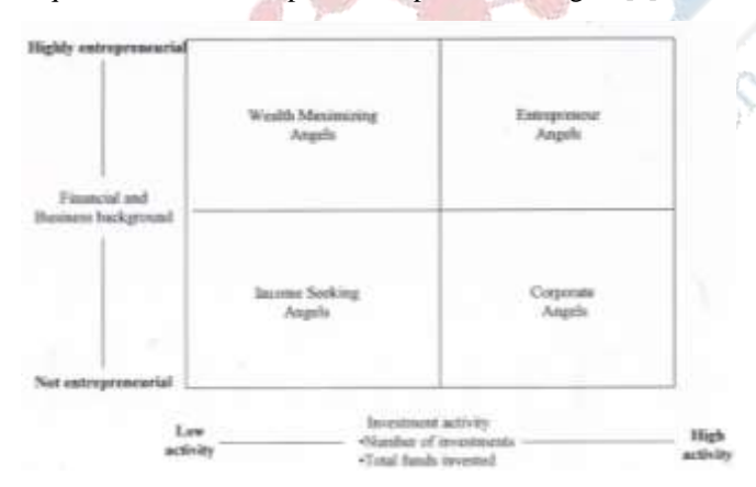
Fig. 1: Suitability of different angel types [8]

Accordingly, active angels include "income seeking angels", "wealth maximising angels", "entrepreneurial angels" and "corporate angels". Potential business angels are categorised as "latent angels" and "virgin angels". In view of the financial entrepreneurial characteristics of the individual angel types discussed above, fig. 1 provides an overview of angel categorisation with regard to their suitability for start-up-specific issues. As a systematisation approach, the